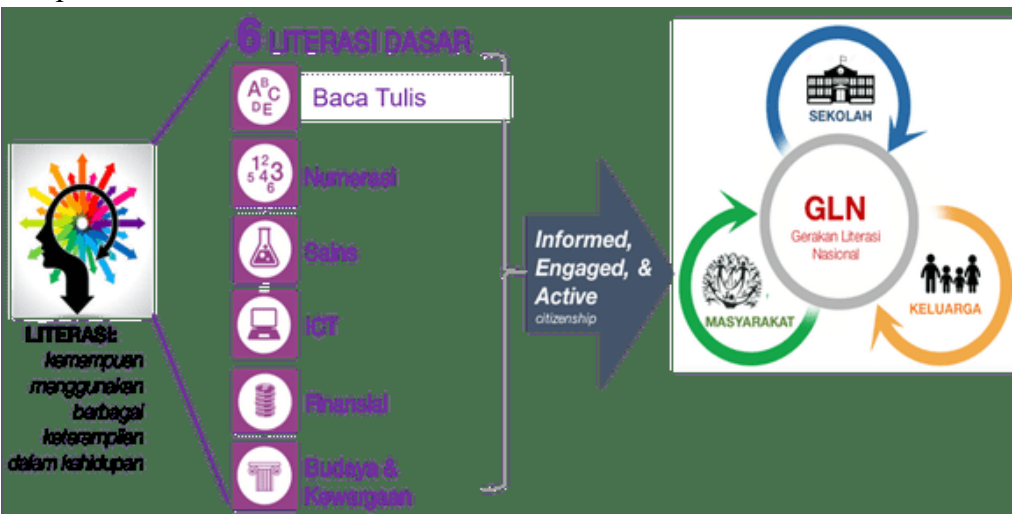
Figure 1. Basic literacy

a. Delivery of training on basic literacy skills in improving reading, writing, numeracy, science, communication information technology (ICT), financial, and cultural & citizenship skills.