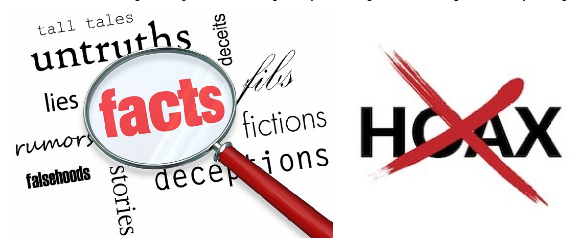
Figure 3. Finding the right information

The search strategy for electronic information sources that are beneficial to the community is indeed very necessary. Searching for information using the internet is very effective and efficient, but it requires the costs required to use the internet. Search for information through Google's search engine by utilizing the features provided by Google.