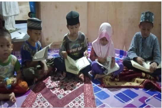
Figure 5. Reading activities and reading habits