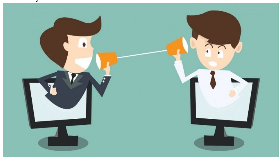
Figure 4. Illustration caring for others

d. Provide motivation for students to have a sense of caring for others in sharing all the information they know.